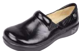
BLACK WAXY KEL-611