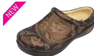
BRONZE VINE KAY-549