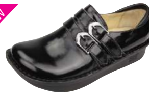
BLACK WAXY ALL-011