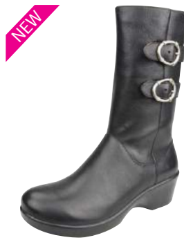
BLACK NAPPA ERI-601