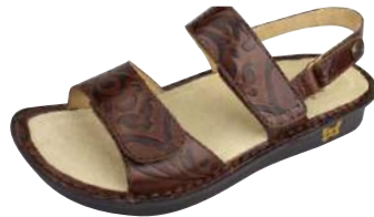
YEEHAW BROWN VER-574