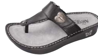
BLACK NAPPA CAR-601

The Carina is one of our most popular thong sandals with leather upper hand-sewn onto the classic mild rocker outsole to give added height. Each Carina is paired with unique hardware for added flair and offers an adjustable upper strap for a customized fit.