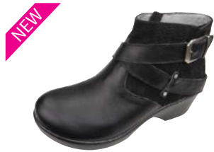
BLACK NAPPA EVA-601

Sophistication with an easygoing attitude, the Eva is inspired from western wear with unmistakable Alegria comfort. Built on the stylish Career Fashion wedge featuring our removable footbed, side zipper and adjustable buckle on full-grain genuine leather upper.