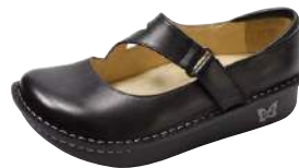
BLACK NAPPA DAY-601