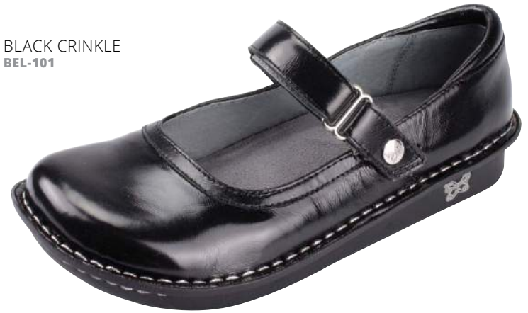
BLACK CRINKLE BEL-101

The Belle is a Mary Jane on the lightweight mini rocker outsole. This shoe offers all of the comfort found in our mild rocker but on a slimmer, lower profile outsole. Dual adjustable straps allow for easy slip on and off.