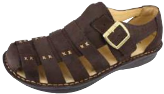
CAFE NUBUCK MAR-202