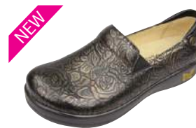
BRONZE BOUQUET KEL-548