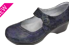
INDIGO DREAM ELL-753