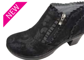
BLACK BEAUTY HAN-931