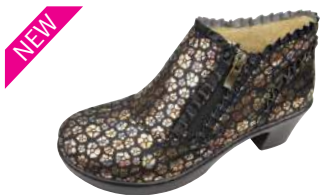
AUTUMN POPPY HAN-486

The Hannah is an ankle bootie on the Career Fashion heel outsole. Ruffled leather edges add a feminine flair to this slimming bootie. Outfitted with the Career Fashion removable footbed for a custom fit and superior support.