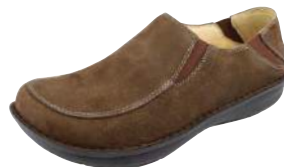
CHOCO NUBUCK SCH-200