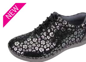
NIGHT POPPY ESS-485