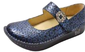
BUTTON UP PAL-213