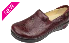
WINE ROSETTE KEL-544