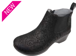
BLACK EMBOSSED PAISLEY EVE-431

This versatile ankle bootie features an elastic gore and inner zipper for easy slip on and off. Selections range from solid basics to wild, glimmering prints. Constructed on the Career Fashion wedge for added height, and outfitted with the Career Fashion removable footbed for a custom fit and superior support.