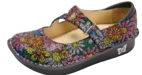
DAISY CHAIN DAY-564