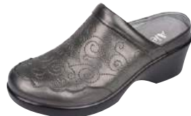
PEWTER EASY ISA-204