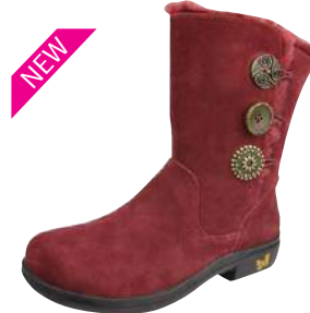
RED LICORICE NAN-914