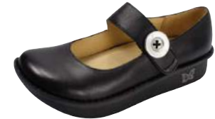
BLACK NAPPA PAL-601