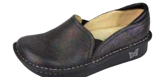
LIZARD SHEEN DEB-733