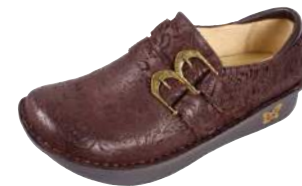
CHOCO EMBOSSED PAISLEY ALL-433