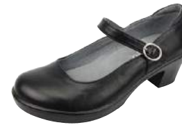
BLACK BUTTER HAR-641