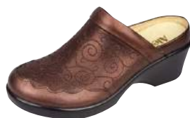
BRONZE EASY ISA-201

The Isabelle is a beautiful spin on the mule clog. Constructed on the Career Fashion wedge for added height, this backless clog is available in hand embroidered patterns and embossed leather uppers. Wavy stitching along the toe cap provides additional interest.