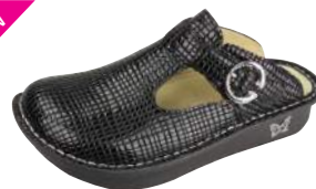
JAZZY BLACK ALG-231