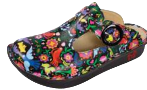
SWEETISH BLACK DON-543