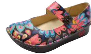
FALL FEATHERS PAL-218