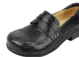
BLACK GLOSSY SNAKE TAY-721