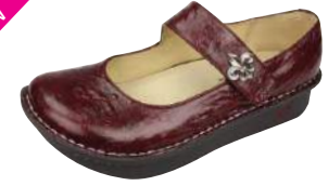
WINE FLEUR PAL-537