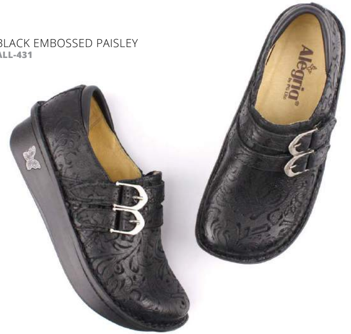
BLACK EMBOSSED PAISLEY ALL-431

The Alli is a fashionable fully-enclosed shoe on the mild rocker outsole. Double metallic buckles offer an eye-catching detail, while the two loop-and-hook closures make for easy slip on and off.