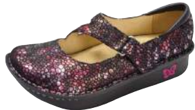
RED METALLIC FUN DAY-249