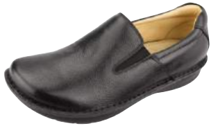
BLACK TUMBLED OZ-100

The Oz is a classic slip-on shoe with hand-sewn leather upper and lining on the mild rocker outsole. The signature removable footbed provides all-day comfort and support. Part of the Professional Collection and features stain-resistant leather for easy maintenance and lab-tested slip-resistant outsole for assuring confidence.