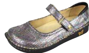
OPAL CRACKLE BEL-752