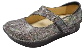
SPRING DOTTIE DAY-248