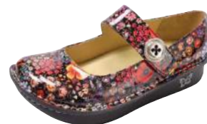
MIDNIGHT GARDEN PAL-323