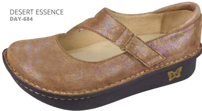
DESERT ESSENCE DAY-684