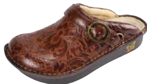
YEEHAW BROWN SEV-574