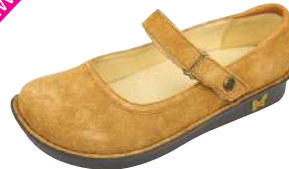
TAN PAISLEY SUEDE BEL-432