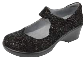
BLACK SPRIGS ELL-551