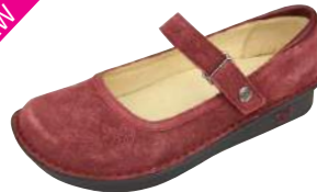
WINE PAISLEY SUEDE BEL-434