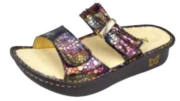
RAINBOW FUN KAR-247