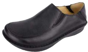
BLACK TUMBLED SCH-100

The Schuster is a versatile slip-on that features hand sewn leather upper and lining on the mild rocker outsole. The collapsible back heel allows this shoe to be worn two ways: either as a closed-back shoe, or an open back slide. The stain-resistant leather upper allows for easy maintenance, and the lab-tested slip-resistant outsole provides assuring confidence on any surface.