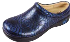
BLUE VALENTINE KAY-416