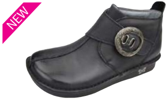
BURNISH BLACK CAT-611

The Caiti is a casual ankle boot on the mini rocker outsole, complete with hand-sewn stitching and a detailed buckle. Full leather lining with adjustable strap across the vamp for easy slip on and off.