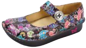
WOMAN'S BEST FRIEND PAL-397