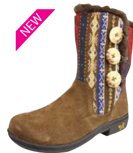
COZY CHOCO NAN-915