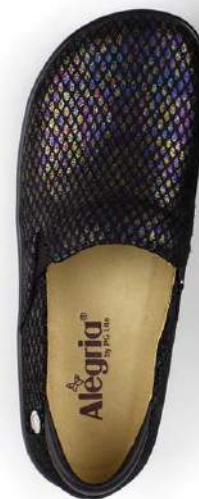
METAL RAIN KEL-751