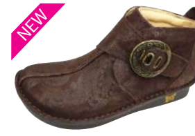
BROWN BEAUTY CAT-932