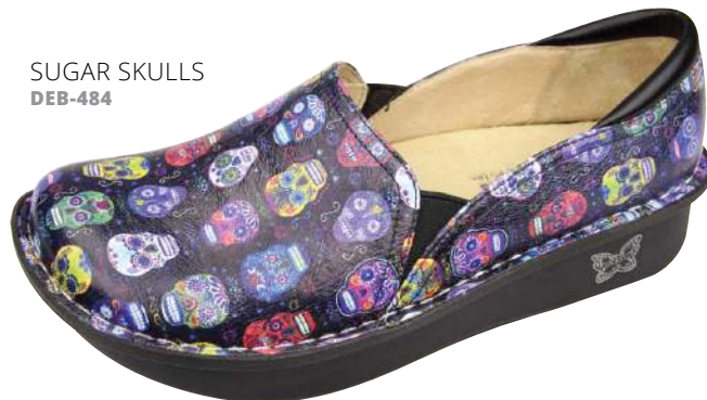
SUGAR SKULLS DEB-484