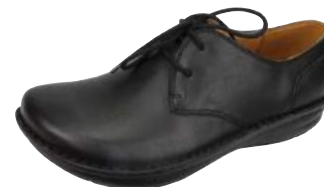
BLACK NAPPA LIA-100

The Liam is a clean and simple lace-up oxford on the slip-resistant mild rocker outsole. Outfitted with a removable footbed to allow for medium and wide width fitting.