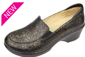
BRONZE BOUQUET EMM-548