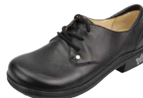
BLACK NAPPA TER-601

The Tera is a simple, no frills lace-up oxford for the working professional. Constructed with beautiful rich nappa leather upper and leather lining, and completed with removable footbed for a custom fit and superior support.