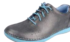
PEWTER EASY ESS-2004