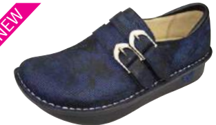
BLUE TWIST ALL-741