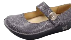
LE ARTIST PAL-240