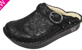
FLOWER FLURRY SEV-220