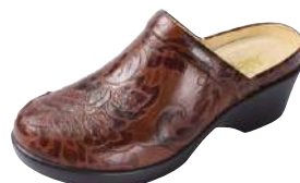
YEEHAW BROWN ISA-574