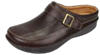
DARK BROWN WAXED TUMBLED CHA-120