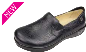
NIGHT ROSETTE KEL-541