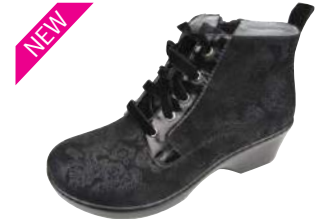
BLACK BEAUTY ELI-931