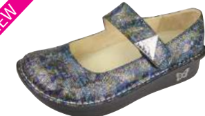
RAVE ON THE NILE PAL-321