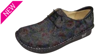
MULTI DOT FLORAL BRE-509

The Bree is a classic oxford built on the lightweight mini rocker bottom. Available in earthy burnish tones and subtle embossed leather, this simple lace-up can be easily paired with any outfit.