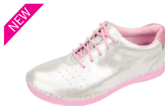
WHITE SHIMMER ESS-212

The Essence is a lightweight leisure lace-up available in soft nappa, metallic or printed leather. Colorful slip-resistant outsole provides additional colorful pop. Outfitted with a removable footbed for superior support.