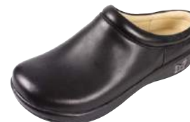
BLACK NAPPA KAY-601