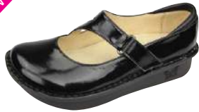
BLACK WAXY DAY-011