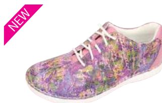
SWEET MÉLANGE ESS-488