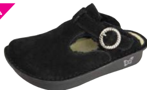
BLACK SHEARLING ALG-910