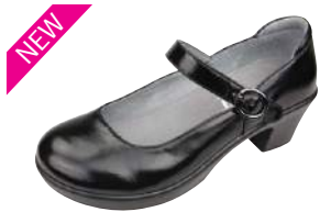
BLACK WAXY HAR-011

An elegant Mary Jane heel with a slip-resistant outsole, the Harper is finished with a simple adjustable buckle. Outfitted with the Career Fashion removable footbed to allow for medium and wide width fitting.