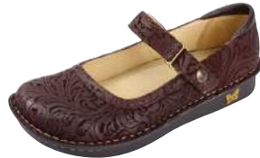
CHOCO EMBOSSED PAISLEY BEL-433