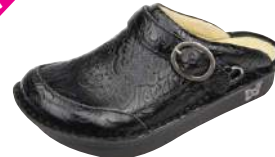
YEEHAW BLACK SEV-691