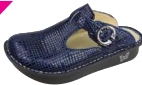
JAZZY BLUE ALG-233