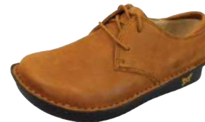
COGNAC BURNISH BRE-637