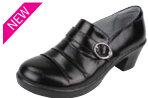
BLACK WAXY HAL-011

The timeless pump gets an eye-catching makeover. With elegant pleating along the supple leather vamp, the Halli is an instant classic. The 2-inch slip-resistant heel gives a boost in height without any sacrifice in comfort. Complete with the Career Fashion removable footbed to allow for medium and wide width fitting.