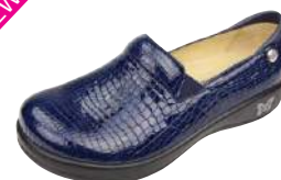
BLUE CROCO KEL-805