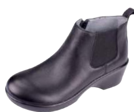
BLACK NAPPA EVE-601