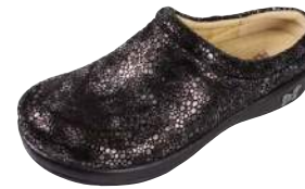
BUBBLE TROUBLE KAY-241