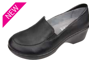
BLACK NAPPA EMM-601