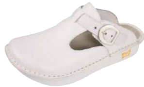
WHITE NAPPA DON-600