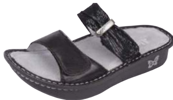
BLACK MIXER KAR-111

This is a traditional slide on the mild rocker bottom with two adjustable straps for a customized fit. Featuring the signature removable footbed, the Karmen is the perfect casual summer staple.