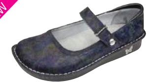
INDIGO DREAM BEL-753