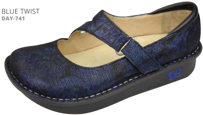
BLUE TWIST DAY-741