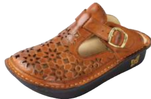
BREEZY DUSTY COGNAC ALG-637