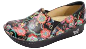
PAISLEY PARTY DEB-480