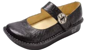
BLACK EMBOSSED ROSE PAL-531