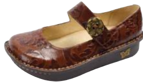
YEEHAW BROWN PAL-574