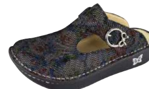
MULTI DOT FLORAL ALG-509