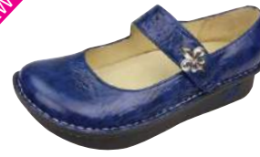
NAVY FLEUR PAL-536