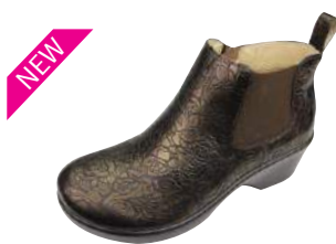
BRONZE BOUQUET EVE-548