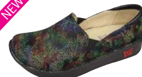
PRIMARY IMPRESSION DEB-730