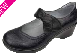
NIGHT ROSETTE ELL-541