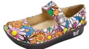
FLOWER POWER PAL-529