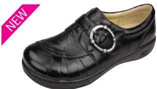
BLACK WAXY KHL-011

The Khloe is a loafer on the Professional outsole. Uniquely designed with intricate hand-sewn pleating on the leather upper and an oversized metallic buckle. Padded heel collar and adjustable tab closure allow for easy slip on and off.