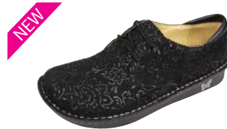
BLACK SPRIGS BRE-551