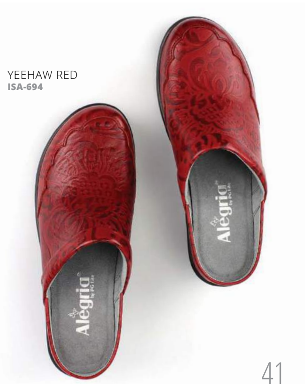
YEEHAW RED ISA-694