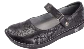
DESERT BLACK BEL-558