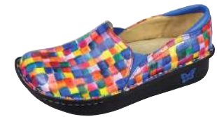
BLOT DEE DA DEB-569