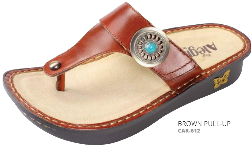
BROWN PULL-UP CAR-612