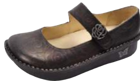
ROSE SHADOW PAL-683