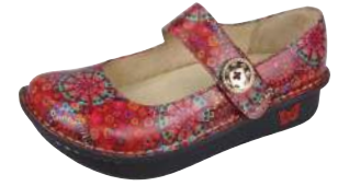
RED BLOOM PAL-393