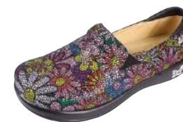
DAISY CHAIN KEL-564