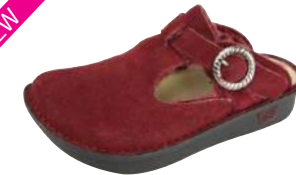
BURGUNDY SHEARLING ALG-914