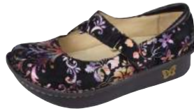
REGAL BEAUTY DAY-557