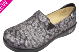
ONYX FIZZ KEL-754