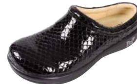
BLACK DROPLET KAY-430