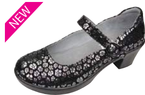
NIGHT POPPY HAR-485