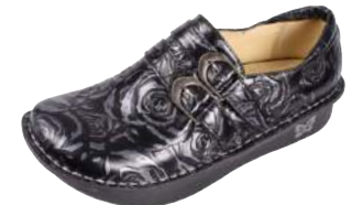
BLACK & SILVER ROSE ALL-571