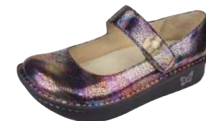
TOTS GORGE PAL-330