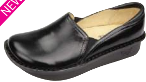
BLACK WAXY DEB-011