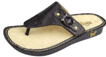
BLACK REPTILE VAN-731