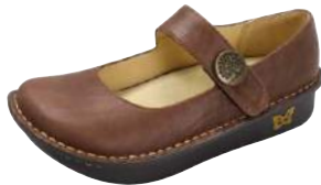
BROWN MAGIC PAL-682