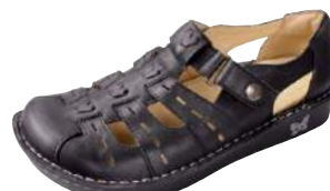
BLACK MAGIC PES-688