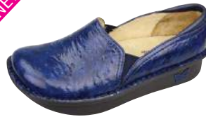
NAVY FLEUR DEB-536