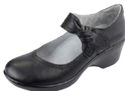
BLACK NAPPA ELL-601