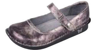
IRON LADY BEL-563