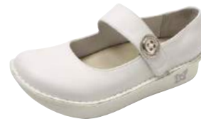
WHITE NAPPA PAL-600S