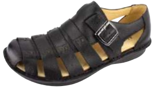
BLACK TUMBLED MAR-100

The Martinique is a popular fisherman-style sandal on the mild rocker outsole. The hand sewn leather upper is accented with contrast stitching, and finished with adjustable buckle hardware. Outfitted with a removable footbed for medium and wide width fitting.