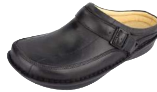
BLACK NAPPA CHA-100

The Chairman is Alegria's take on a traditional men's clog. This shoe features a swivel strap that can easily convert this open back clog into a sling-back shoe. Leather upper hand sewn onto the mild rocker outsole with a removable footbed made with soft polyurethane, cork and memory foam for a custom fit and superior support.