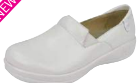
WHITE WAXY KEL-610