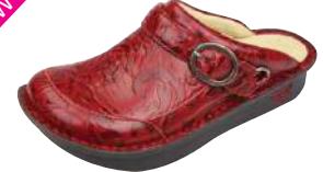
YEEHAW RED SEV-694