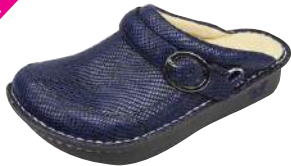
BLUE SNAKY JAKE SEV-212