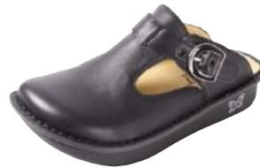
BLACK NAPPA ALG-601