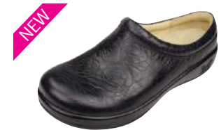
NIGHT ROSETTE KAY-541