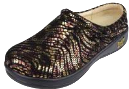
GOLDEN JUNGLE KAY-542