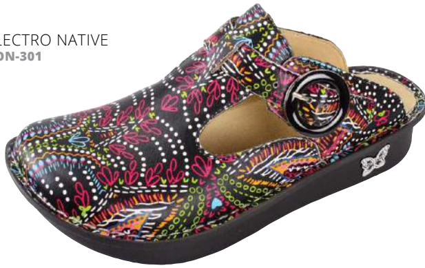
ELECTRO NATIVE DON-301