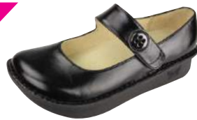
BLACK WAX PAL-011