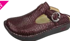
JAZZY WINE ALG-232