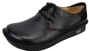
BURNISH BLACK BRE-611