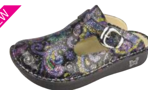
SURREALLY PRETTY ALG-542