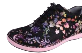
REGAL BEAUTY ESS-557