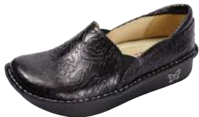
BLACK EMBOSSED ROSE DEB-531