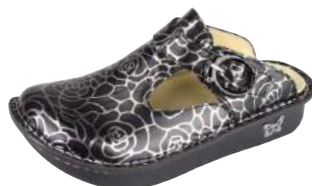
ONYX ROSE ALG-530