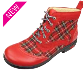
CANDY APPLE KYL-604