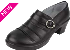
BLACK NAPPA HAL-601