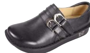
BURNISH BLACK ALL-611