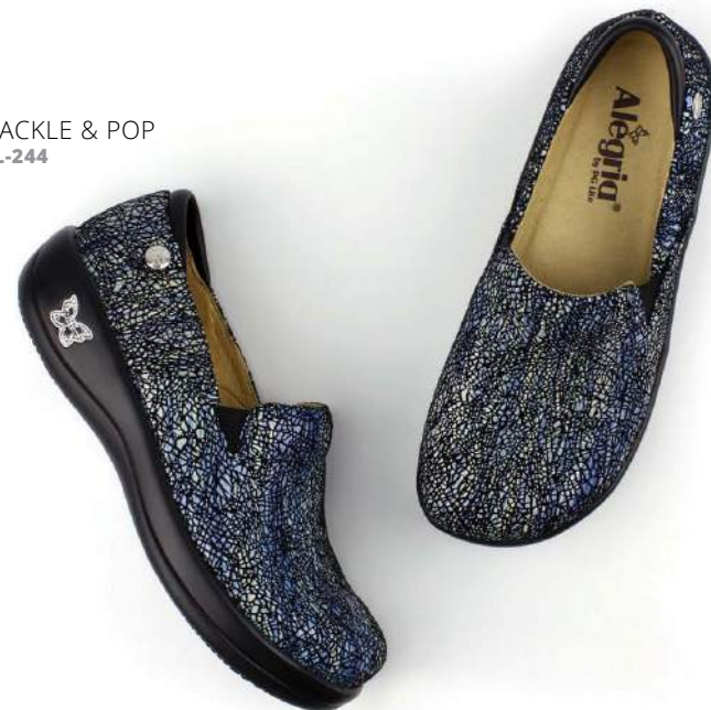
CRACKLE & POP KEL-244

The Keli is a slip-on shoe with slimmer silhouette on the lightweight, flexible Professional outsole. Features padded collar and heel for comfortable wear throughout the day. Elastic gores along the vamp allow for easy slip on and off.