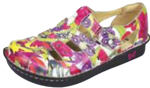
HAPPY DAYS PES-525