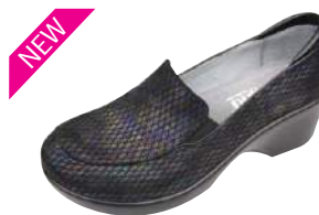
METAL RAIN EMM-751