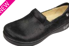
BLACK MOSAIC KEL-755