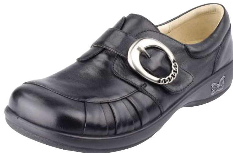
BLACK NAPPA KHL-601