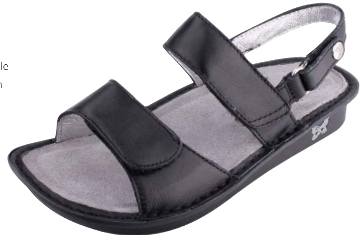
BLACK NAPPA VER-601