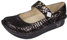
ONYX JUNGLE PAL-543