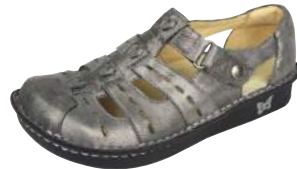
PEWTER EASY PES-204