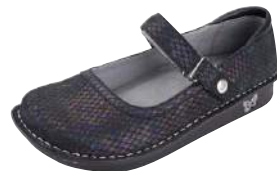
METAL RAIN BEL-751