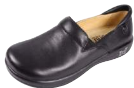
BLACK NAPPA KEL-601