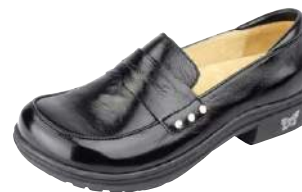
BLACK WAXY TAY-611

The Taylor is our spin on the classic penny loafer. Features timeless design and a slip-resistant rubber outsole makes this shoe suitable for various environments.