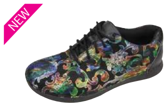
REGAL RAINBOW ESS-487