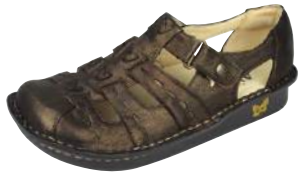
BRONZE EASY PES-201

The Pesca is our version of the traditional fisherman sandal. Features the signature removable footbed with adjustable leather upper that is hand-sewn on to the mini rocker outsole.