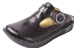
BLACK EMBOSSED ROSE ALG-531