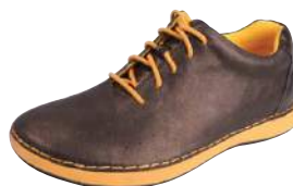
BRONZE EASY ESS-2003