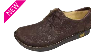
CHOCO SPRIGS BRE-552