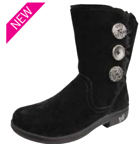
BLACK LICORICE NAN-910

To warm up on a cold day, look no further than the suede Nanook mid-calf boot. Setting it apart are its three distinctive buttons on elastic loop closure. Easy pull on and off, with a removable footbed for a custom fit and superior support.