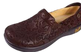
CHOCO EMBOSSED PAISLEY KEL-433