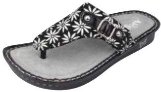
SILVER GERBER VAN-321

The Vanessa is a popular thong sandal offered on the slimmer, mini rocker outsole. Featuring fully adjustable vamp, lightweight, flexible sole and a fixed footbed loaded with signature Alegria comfort.