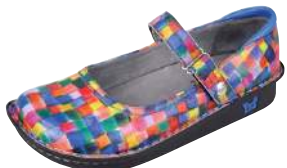
BLOT DEE DA BEL-569