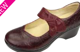
WINE ROSETTE ELL-544