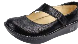
BLACK DOTTIE DAY-561