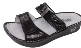
BLACK METALLIC FUN KAR-237