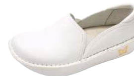
WHITE NAPPA DEB-600