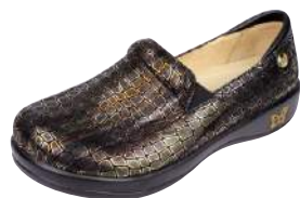
FANCY GIRAFFE KEL-412