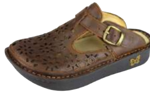
BREEZY TAWNY ALG-644