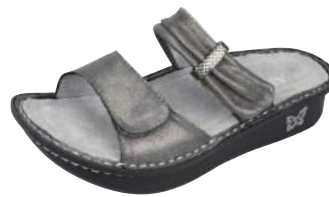
PEWTER EASY KAR-204