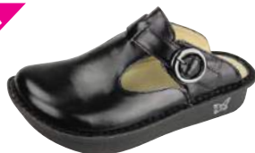
BLACK WAXY ALG-011