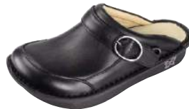
BLACK NAPPA SEV-601