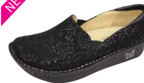
BLACK SPRIGS DEB-551