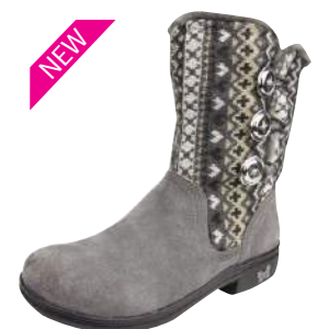
COZY GREY NAN-916