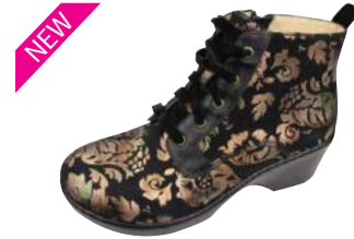
REGAL COPPER ELI-560

The Eliza is another addition to the Career Fashion wedge family. This ankle boot is all about the beautiful details while side zipper and laced upper ensure an easy and perfect wear.