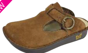
CHOCO SHEARLING ALG-913