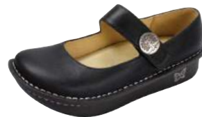
BLACK MAGIC PAL-688