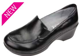
BLACK WAXY EMM-011

The simple, elegant silhouette of the Emma is ideal for the work place and dinner thereafter, and the added height from the wedge makes it easy to pair with skirt, dress or pants. Slip-resistant outsole for assuring confidence at work and on the dance floor. Outfitted with the Career Fashion removable footbed to allow for medium and wide width fitting.