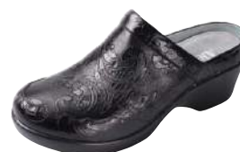
YEEHAW BLACK ISA-691