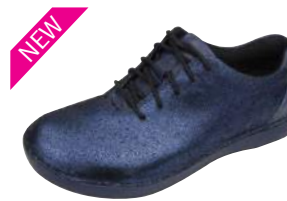
BLUE MOSAIC ESS-756