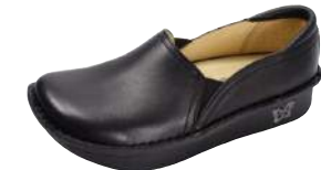
BLACK NAPPA DEB-601