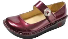
WINE GLITTER PATENT PAL-528