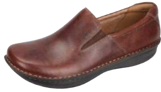
CHOCO WAXED TUMBLED OZ-145