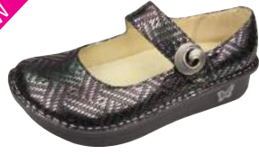
PEWTER DAZZLER PAL-532