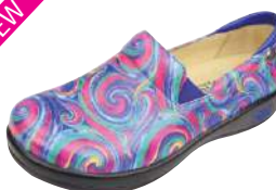
SWIRLY GOODNESS KEL-686