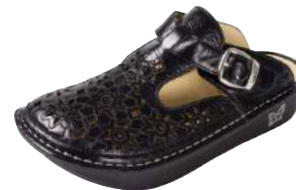
BREEZY DUSTY BLACK ALG-631