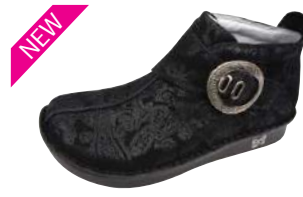
BLACK BEAUTY CAT-931