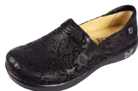
BLACK EMBOSSED PAISLEY KEL-431