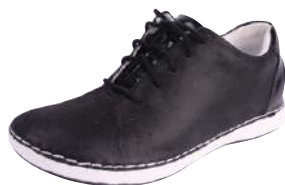
BLACK EASY ESS-1003