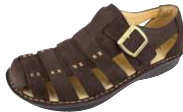
CAFE NUBUCK | AM-MAR-202