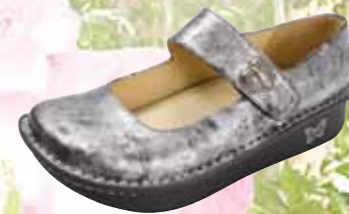
PEWTER BLACK TUMBLE | PAL-621