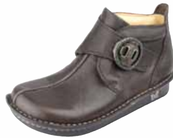
DRIFTED | CAT-643