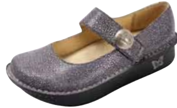
LE ARTIST | PAL-240