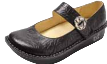
BLACK EMBOSSED ROSE | PAL-531