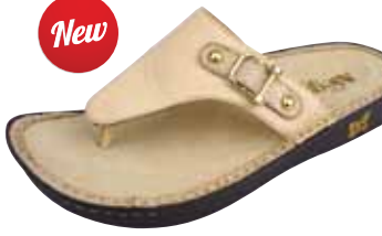
OAT | VAN-638