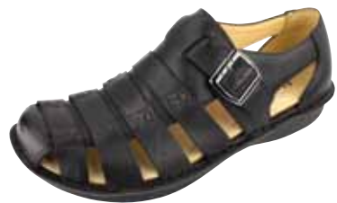
BLACK TUMBLLED | AM-MAR-100

The Martinique is a popular fisherman-style sandal on the mild rocker outsole. The hand sewn leather upper is accented with contrast stitching, and finished with adjustable buckle hardware. Outfitted with a removable footbed for medium and wide width fitting.