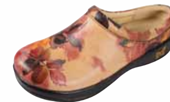
WESTERN ROMANCE | KAY-526