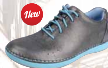
PEWTER EASY | ESS-204

The Essence is a lightweight leisure lace-up available in soft nappa, metallic or printed leather. Colorful slip-resistant outsole provides additional colorful pop. Outfitted with a removable footbed for superior support.