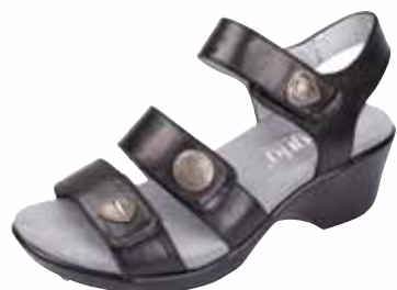
DUSTY BLACK | OLI-631

The Olivia is a classic three-strap wedge, embellished with three distinctive button hardware. Exposed footbed is made with soft polyurethane, cork and memory foam for superior support. The three points of adjustability offers maximum customization in fit.