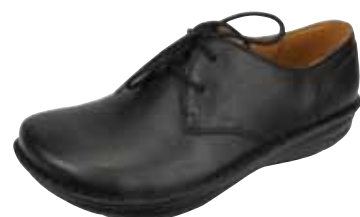
BLACK NAPPA | AM-LIA-100

The Liam is a clean and simple lace-up oxford on the slip-resistant mild rocker outsole. Outfitted with a removable footbed to allow for medium and wide width fitting.