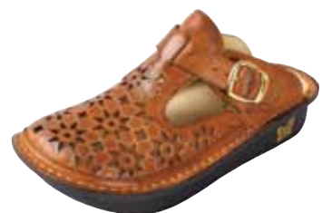
BREEZY DUSTY COGNAC | ALG-637