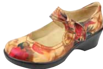
WESTERN ROMANCE | ELL-526