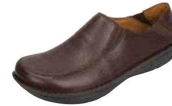
CHOCO | AM-SCH-140