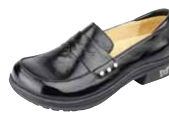
BLACK WAXY | TAY-611