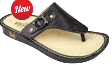
BLACK REPTILE | VAN-731