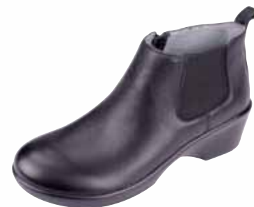
BLACK NAPPA | EVE-601