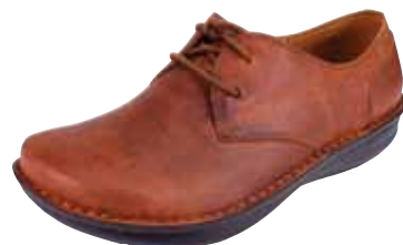
TAWNY | AM-LIA-160