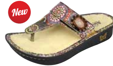
KENYA | CAR-392