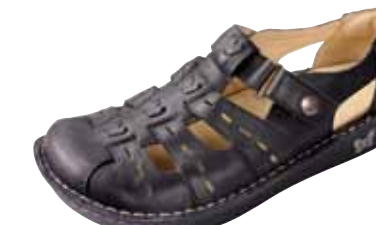
BLACK MAGIC | PES-688