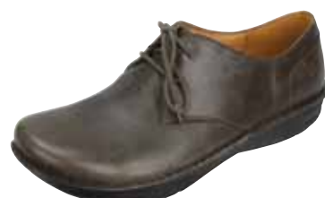
DRIFTED | AM-LIA-170