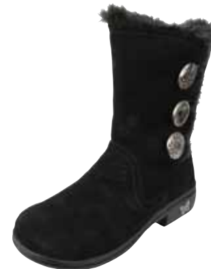
BLACK SUEDE | NAN-901

To warm up on a cold day, look no further than the suede Nanook mid-calf boot. Setting it apart are its three distinctive buttons on elastic loop closure. Easy pull on and off, with a removable footbed for a custom fit and superior support.