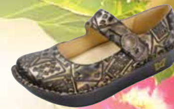
POKER FACE | PAL-535