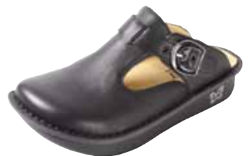
BLACK NAPPA | ALG-601