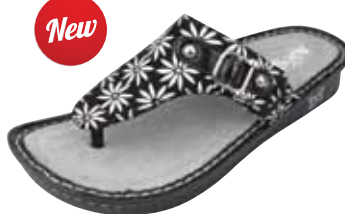
SILVER GERBER | VAN-321