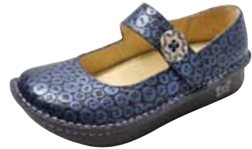
BUTTON-UP | PAL-213