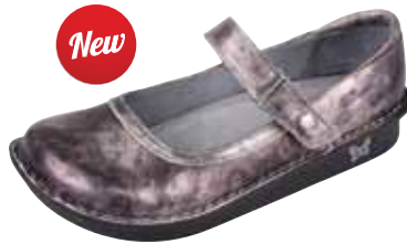
IRON LADY | BEL-563