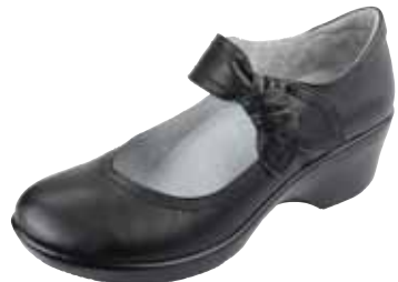
BLACK NAPPA | ELL-601