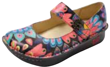
FALL FEATHERS | PAL-218