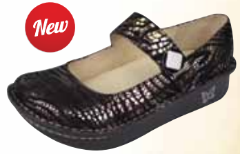
ONYX JUNGLE | PAL-543