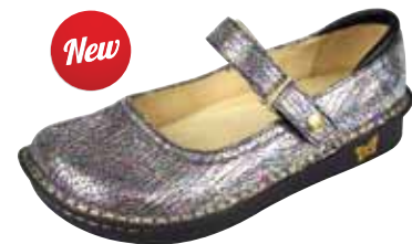
OPAL CRACKLE | BEL-752