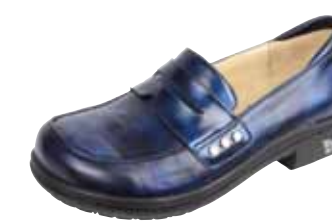
BRUSH OFF BLUE | TAY-616