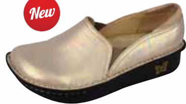
ABALONE | DEB-243