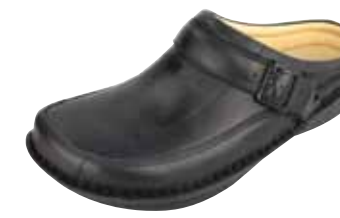
BLACK NAPPA | AM-CHA-100

The Chairman is Alegria's take on a traditional men's clog. This shoe features a swivel strap that can easily convert this open back clog into a sling-back shoe. Leather upper hand sewn onto the mild rocker outsole with a removable footbed made with soft polyurethane, cork and memory foam for a custom fit and superior support.