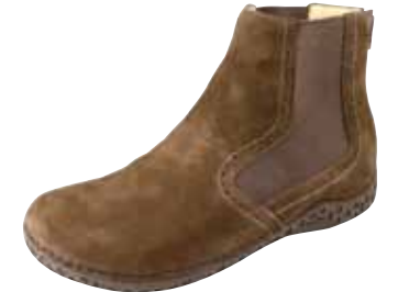
CHOCO NUBUCK | AM-JON-200