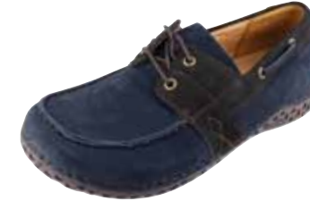
NAVY | AM-FRA-313