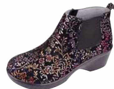
METAL SPRIGS | EVE-559