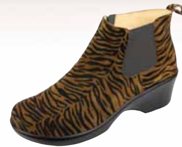
ROAR | EVE-402