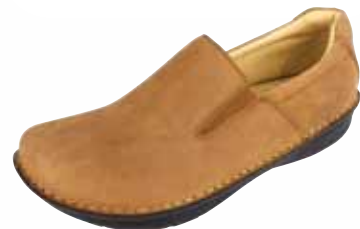
CHESTNUT OILY NUBUCK | AM-OZ-204