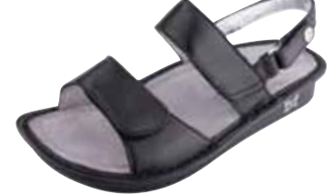
BLACK NAPPA | VER-601