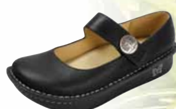
BLACK MAGIC | PAL-688