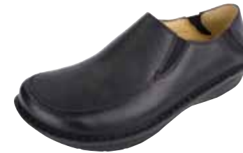
BLACK TUMBLED | AM-SCH-100

The Schuster is a versatile slip-on that features hand sewn leather upper and lining on the mild rocker outsole. The collapsible back heel allows this shoe to be worn two ways: either as a closed-back shoe, or an open back slide. The stain-resistant leather upper allows for easy maintenance, and the lab-tested slip-resistant outsole provides assuring confidence on any surface.