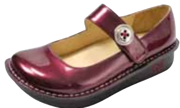
WINE GLITTER PATENT | PAL-528