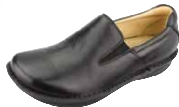
BLACK TUMBLED | AM-OZ-100

The Oz is a classic men's slip-on shoe, with hand sewn leather upper and lining on the mild rocker outsole. This full coverage shoe with a removable footbed provides all day comfort and support. The Professional Collection features stain-resistant leather for easy maintenance and lab-tested slip-resistant outsole for assuring confidence on any surface.