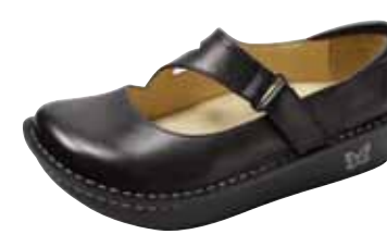
BLACK NAPPA | DAY-601