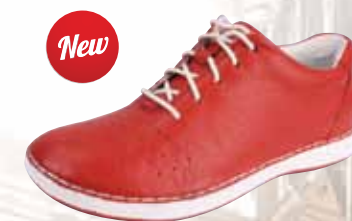
TOMATO | ESS-623