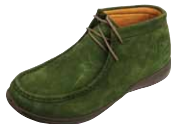
OLIVE SUEDE | AM-PAC-700