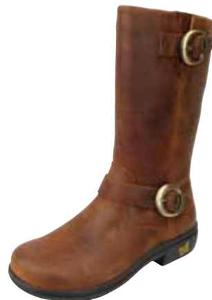
TAWNY | KRI-644