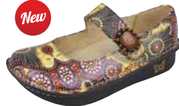
KENYA | PAL-392