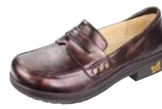
BRUSH OFF BROWN | TAY-617