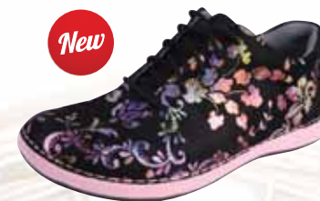
REGAL BEAUTY | ESS-557