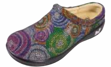
BULLSEYE | KAY-387