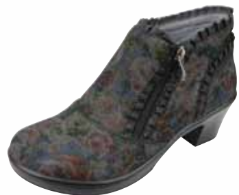
MULTI DOT FLORAL | HAN-509

The Hannah is an ankle bootie on the Career Fashion heel outsole. Ruffled leather edges add a feminine flair to this slimming bootie. Outfitted with the Career Fashion removable footbed for a custom fit and superior support.