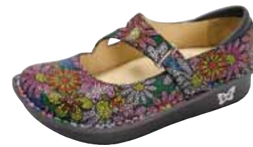
DAISY CHAIN | DAY-564