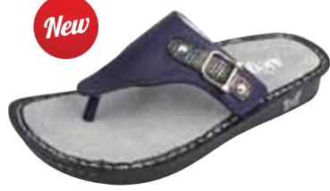
NAVY | VAN-622