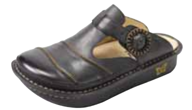
ZIPPIE | ALG-946