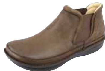
DARK BROWN NUBUCK | AM-LEW-200