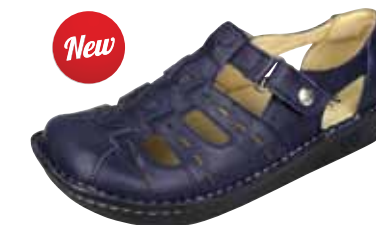
NAVY | PES-622