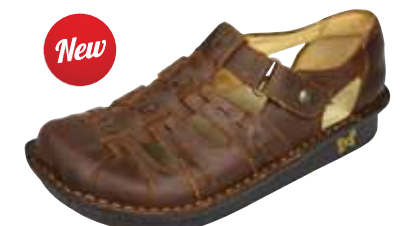
TAWNY | PES-644