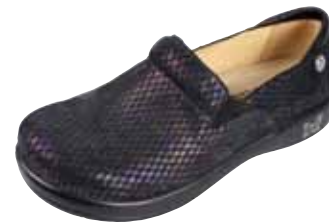
METAL RAIN | KEL-751