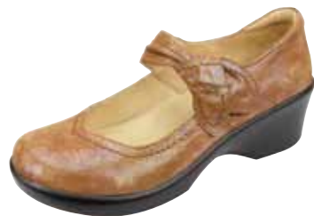
DESERT ESSENCE | ELL-684