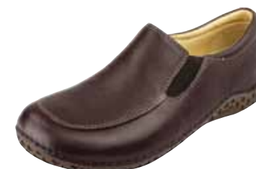
CHOCO TUMBLED | AM-FOX-200