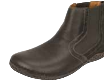
DRIFTED | AM-JON-170