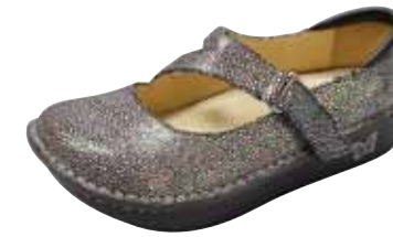
SPRING DOTDIE | DAY-248