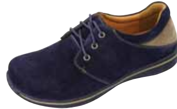
NAVY SUEDE w/SAND | AM-ALE-613