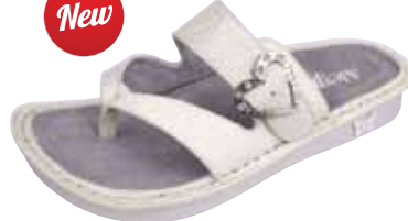
SUMMER NIGHTS | VAL-350