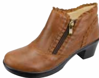
SADDLE | HAN-632