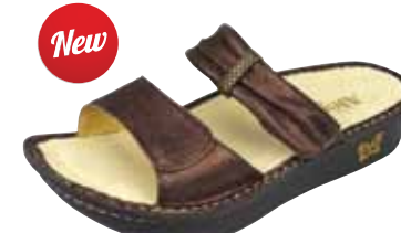
BRONZE EASY | KAR-201