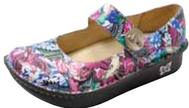
FINCH | PAL-219