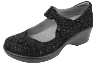
BLACK SPRIGS | ELL-551