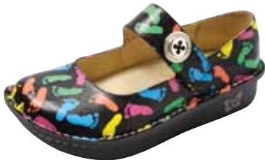
BABY FEET | PAL-214