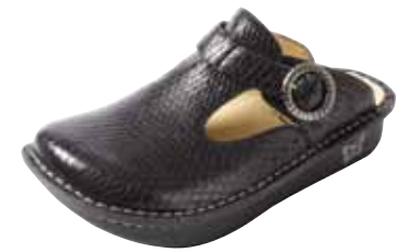
BLACK BURNISH SNAKE | ALG-711