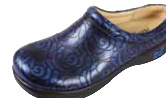
BLUE VALENTINE | KAY-416