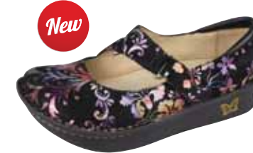
REGAL BEAUTY | DAY-557