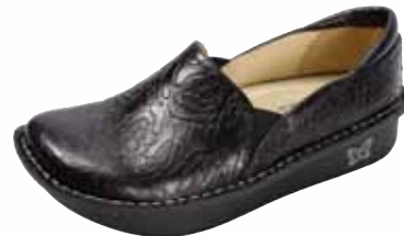
BLACK EMBOSSED ROSE | DEB-531