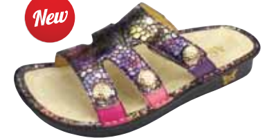
PURPLE GLEM | VEN-724

A three-buckle slide on the lightweight mini rocker bottom, the Venus is a bold, colorful sandal that stands out in the crowd. The gleaming leather upper offers three points of adjustability, and the signature removable footbed provides lasting arch support.