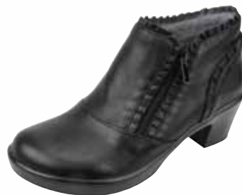
BLACK NAPPA | HAN-601