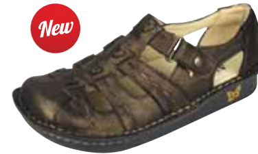
BRONZE EASY | PES-201

The Pesca is Alegria's version of the classic fisherman sandal. Features the signature removable footbed with adjustable leather upper that is hand sewn on to the mini rocker outsole.