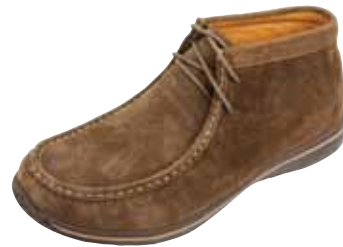
CHOCO NUBUCK | AM-PAC-200