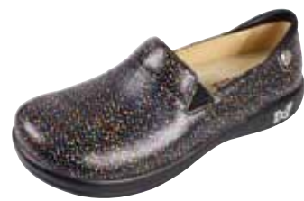
RAINBOW RAIN | KEL-635