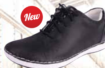
BLACK EASY | ESS-1003