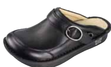
BLACK NAPPA | SEV-601