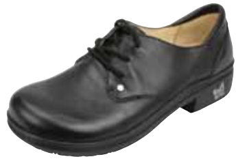
BLACK NAPPA | TER-601

The Tera is a simple, no frills lace-up oxford for the working professional. Constructed with beautiful rich nappa leather upper and leather lining, and completed with removable footbed for a custom fit and superior support.