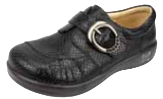
BLACK BURNISH SNAKE | KHL-711