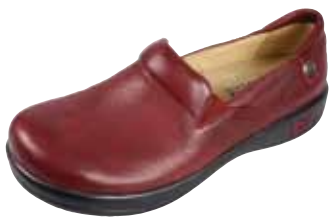
RHONE RED | KEL-607