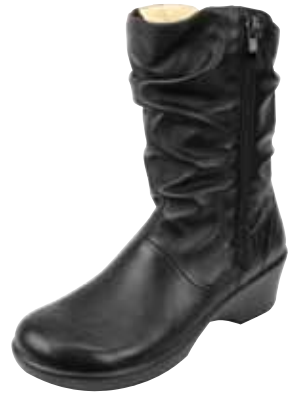
BLACK BUTTER | IVY-641

The Ivy is a beautiful mid-calf boot on the Career Fashion wedge, featuring double zippers that fully unzip for easy slip on and off. Scrunched leather upper and patterned inner lining are eye-catching elements unique to this boot. Outfitted with the Career Fashion removable footbed for a custom fit and superior support.