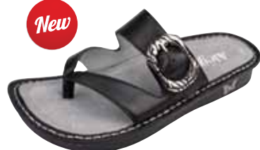
BLACK BUTTER | VAL-641