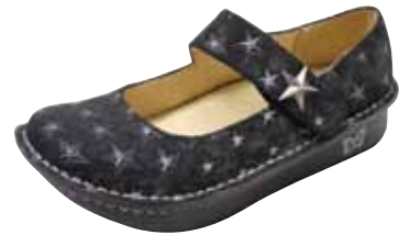
STAR-STUDED | PAL-357