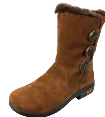
HOT COCOA SUEDE | NAN-903