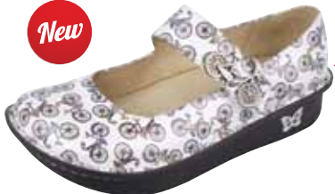
TOUR | PAL-221