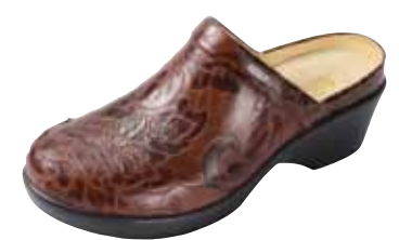
YEEHAW BROWN | ISA-574