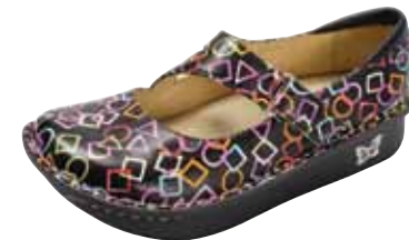
IN SHAPE | DAY-362