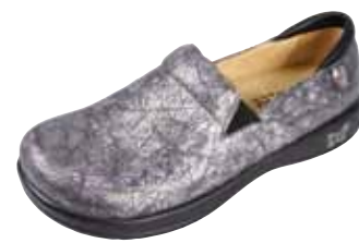
DISCO DESERT | KEL-565