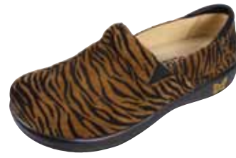
ROAR | KEL-402