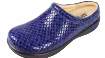
DROPLET | KAY-428