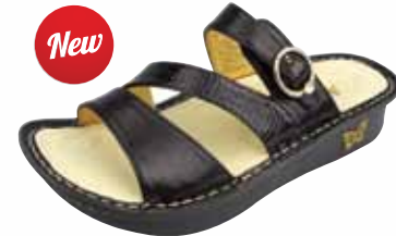
BLACK REPTILE | COL-731