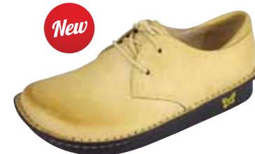
BUTTERNUT | BRE-626