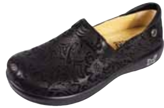
BLACK EMBOSSED PAISLEY | KEL-431