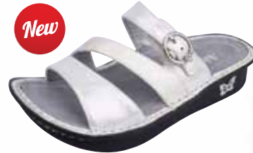
SUMMER NIGHTS | COL-350