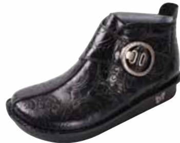
YEEHAW BLACK | CAT-691