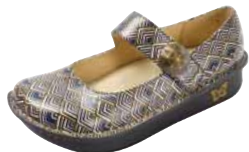
PYRAMIDS | PAL-394