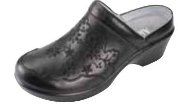
BLACK EMBROIDERY | ISA-631