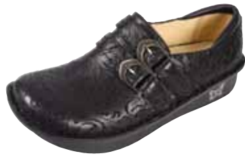
BLACK EMBOSSED PAISLEY | ALL-431

The Alli is a fashionable fully-enclosed shoe on the mild rocker outsole. Double metallic buckles offer an eye-catching detail, while the two loop-and-hook closures make for easy slip on and off.