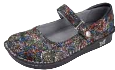
CATHEDRAL | BEL-391