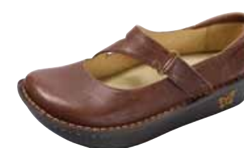
CAROLINA BROWN | DAY-815