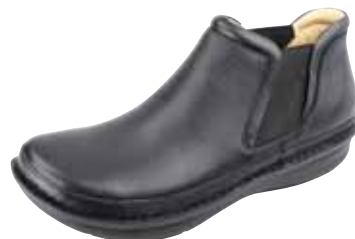
BLACK TUMBLED | AM-LEW-100

This high-top ankle boot features hand sewn leather upper and a removable footbed. Double elastic gores allow for easy slip on and off. Constructed on the mild rocker outsole for all day comfort and support.