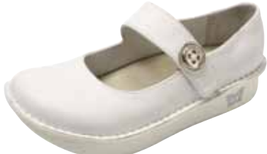
WHITE NAPPA | PAL-600S