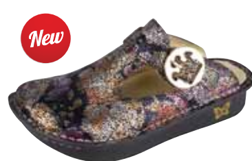
FLORATOPIA | ALG-557