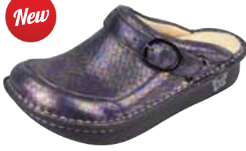
BRAIDY | SEV-219