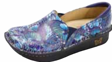
FLIGHT | DEB-481