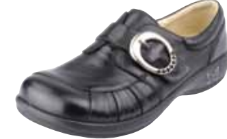
BLACK NAPPA | KHL-601