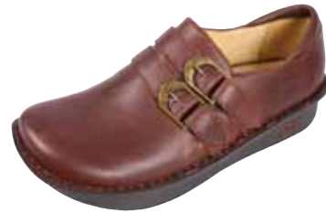
SUNNED | ALL-662