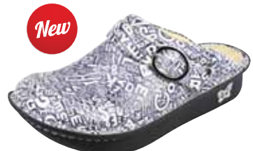
ALPHABETCHA WHITE | SEV-560