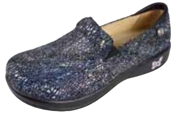
CRACKLE & POP | KEL-244

The Keli is a full-coverage slip-on with a slimmer silhouette on the lightweight, flexible Career Fashion Pro outsole. Features padded collar and heel for comfortable wear throughout the day. Elastic gores along the vamp allow for easy slip on and off. Choose from printed, embossed, metallic or rich nappa leather uppers.