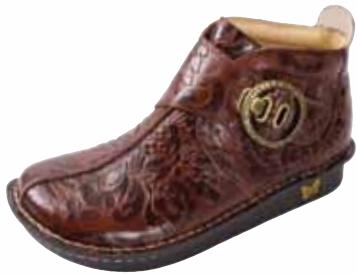
YEEHAW BROWN | CAT-574

The Caiti is a casual ankle boot on the mini rocker bottom, complete with hand sewn stitching and buckle detail. Full leather lining with adjustable strap across the vamp for easy slip on and off.