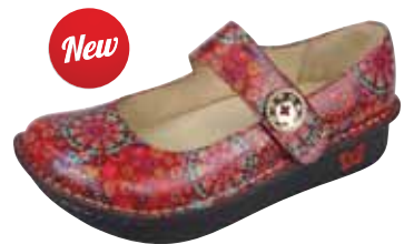
RED BLOOM | PAL-393