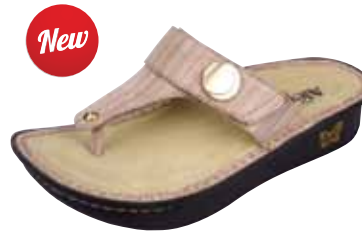
NATURALLY | CAR-817