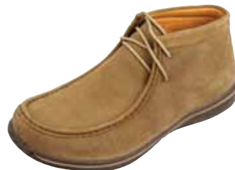
TAUPE NUBUCK | AM-PAC-609