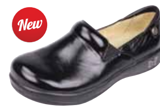
BLACK WAXY | KEL-611