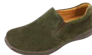
OLIVE SUEDE | AM-AAR-700