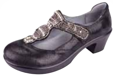
BLACK CRACKLE | HAZ-101