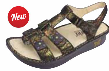
THRONES | KLE-238

Kleo represents Alegria's interpretation on the gladiator sandal. Leather upper hand sewn onto the mild rocker bottom, the Kleo offers three separate points of adjustability for maximum customization in fit. Selections include rich solid colors or playful patterns.