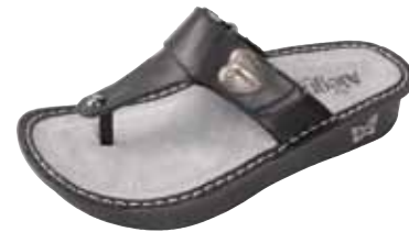
BLACK NAPPA | CAR-601