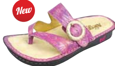
PINK WAVE | VAL-645