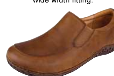
TAWNY | AM-FOX-160