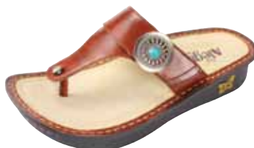
BROWN PULL-UP | CAR-612