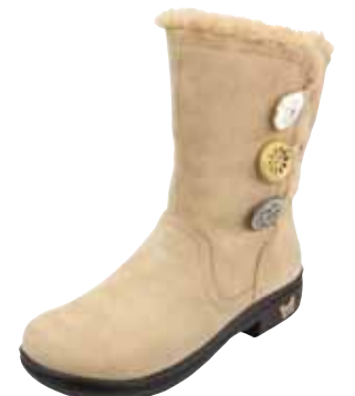
SAND SUEDE | NAN-909