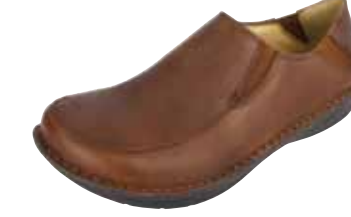
COGNAC PULL-UP | AM-SCH-500