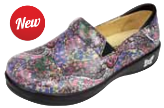
JIMI PAISLEY | KEL-508