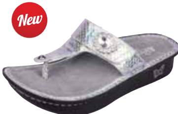
SLITHER SHINE | CAR-704