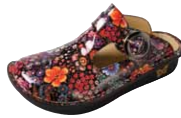
MIDNIGHT GARDEN PATENT | DON-323S