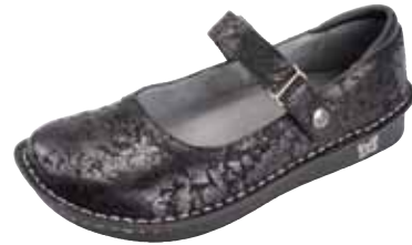
DESERT BLACK | BEL-558