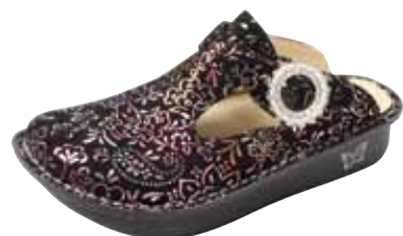
METAL SPRIGS | ALG-559