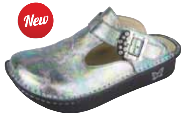
PRISMATIC | ALG-207

The Classic clog is the original "Happy Clog" that started it all. Features leather upper hand sewn onto the mild rocker outsole with a removable footbed made with soft polyurethane, cork and memory foam for a custom fit and superior support.