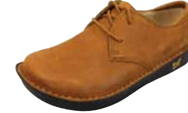
COGNAC BURNISH | BRE-637