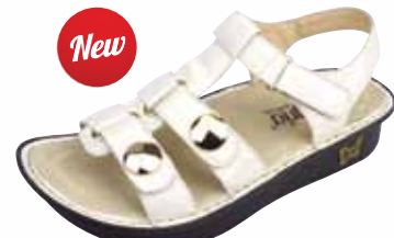
IVORY SHEEN | KLE-720