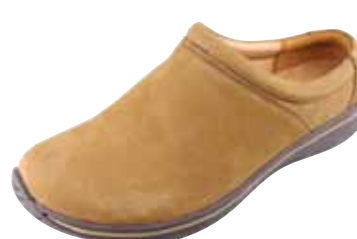
TAUPE | AM-ART-800