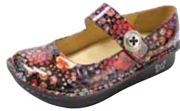
MIDNIGHT GARDEN | PAL-323