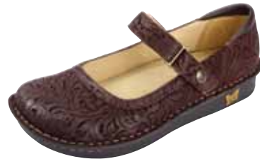
CHOCO EMBOSSED PAISLEY | BEL-433