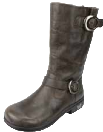
DRIFTED | KRI-643