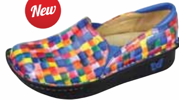
BLOT-DEE-DA | DEB-569