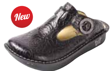
BLACK EMBOSSED ROSE | ALG-531