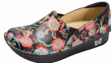
PAISLEY PARTY | DEB-480