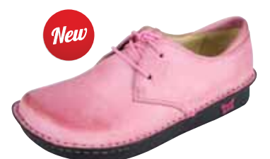
PETAL BURNISH | BRE-619