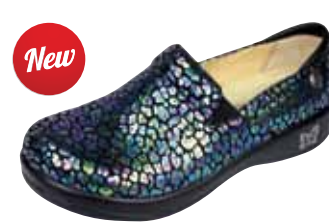
JACINTA | KEL-484