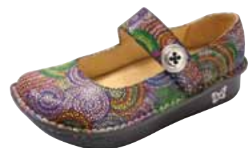
BULLSEYE | PAL-387