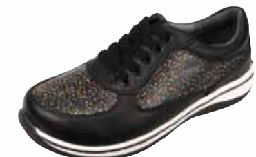
RAINBOW RAIN | CIN-635