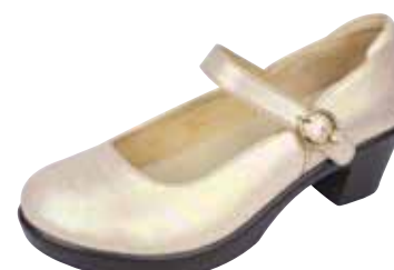
ABALONE | HAR-243

An elegant Mary Jane heel with a slip-resistant outsole, the Harper is finished with a simple adjustable buckle. Outfitted with the Career Fashion removable footbed to allow for medium and wide width fitting.