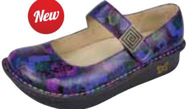
CRAFTY | PAL-220