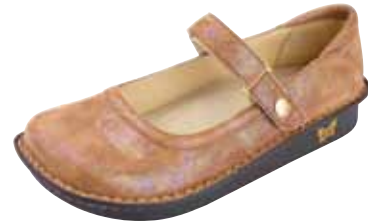
DESERT ESSENCE | BEL-684