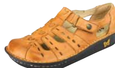
COGNAC | PES-647