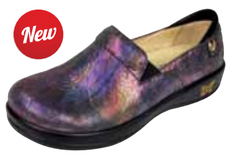
MULTI VALENTINE | KEL-685