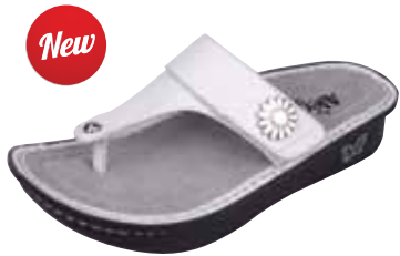
WHITE POPPY | CAR-210

This is a traditional slide on the mild rocker bottom with two adjustable straps for a customized fit. Featuring the signature removable footbed, the Karmen is the perfect casual summer staple.