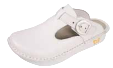
WHITE NAPPA | DON-600