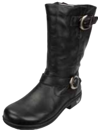
BLACK BUTTER | KRI-641

The Kris is Alegria's classic tall boot, featuring two saddle buckle details. Full-length zipper along the inside makes it easy to slip on and off. Offered in rich, oily leather uppers, with a removable footbed for a custom fit and superior support.