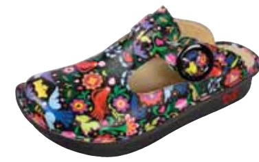
SWEETISH BLACK | DON-543