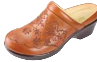
COGNAC BURNISH | ISA-647