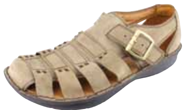
TAUPE | AM-MAR-800