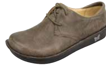
STONEWALL | BRE-603

The Bree is a classic oxford built on the lightweight mini rocker bottom. Available in earthy burnish tones and subtle embossed leather, this simple lace-up can be easily paired with any outfit.