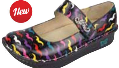
MOUSTACHE | PAL-222