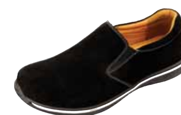
BLACK OUT SUEDE | AM-AAR-611