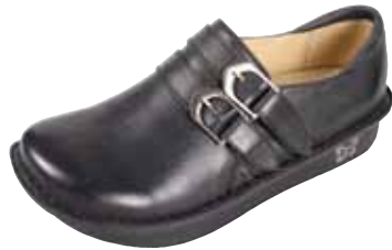
BURNISH BLACK | ALL-611