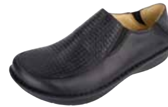
BLACK WOVEN | AM-SCH-103