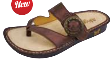
BRONZE EASY | VAL-201