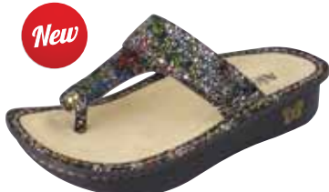
CATHEDRAL | CAR-391