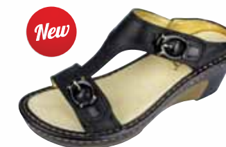
KENYA | LAR-392