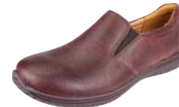
CHOCO WAX TUMBLED | AM-AAR-145