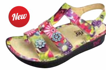
HAPPY DAYS | KLE-525