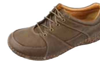
DARK BROWN | AM-BAR-200