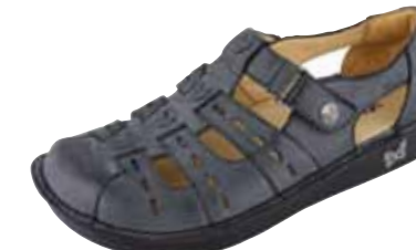
MIDNIGHT BURNISH | PES-630