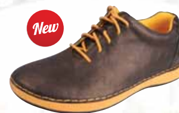
BRONZE EASY | ESS-2003