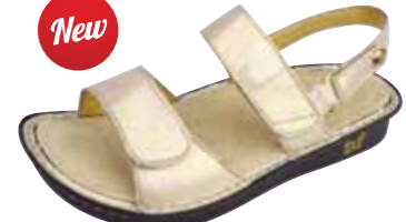
ABALONE | VER-243