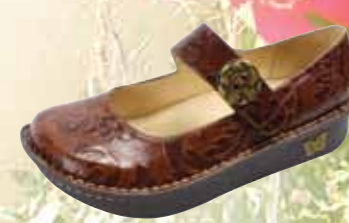
YEEHAW BROWN | PAL-574