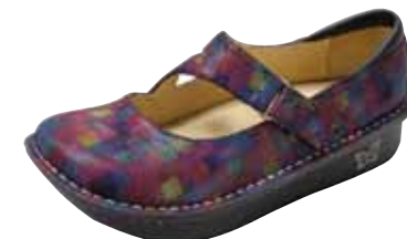
SQUARESVILLE | DAY-740