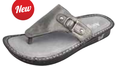
PEWTER EASY | VAN-204