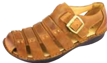
BROWN TUMBLLED | AM-MAR-200