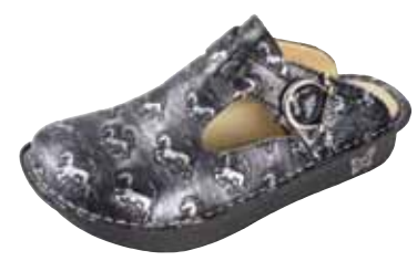
LUCKY HORSE | DON-304