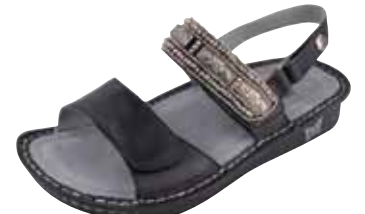
ANTIQUE PEWTER | VER-834