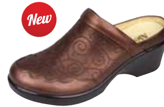
BRONZE EASY | ISA-201

The Isabelle is a beautiful spin on the mule clog. Constructed on the Career Fashion wedge for added height, this backless clog is available in hand embroidered patterns and embossed leather uppers. Wavy stitching along the toe cap provides additional interest.