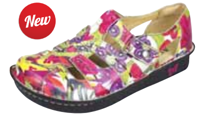
HAPPY DAYS | PES-525