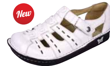
WHITE BUTTER | PES-620