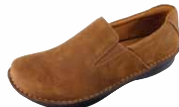
CAFE | AM-OZ-212