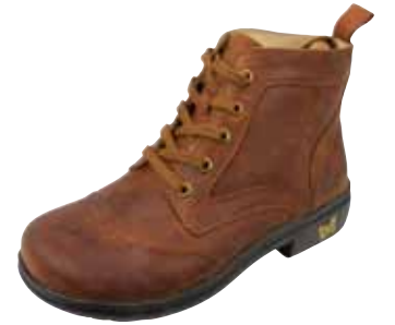
TAWNY | KYL-644