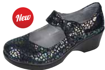
JACINTA | ELL-484

The Ella is a Mary Jane wedge with a straightforward tab closure that adjusts for custom fitting. Beautifully detailed with outline stitching along the leather upper, and finished with a simple knot on the strap. Outfitted with the Career Fashion removable footbed to allow for medium and wide width fitting.