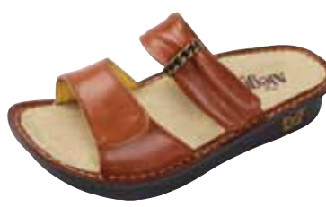
COGNAC | KAR-647