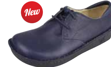
NAVY | BRE-622