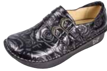
BLACK & SILVER ROSE | ALL-571