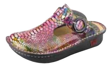
RAINBOW SNAKE | ALG-716