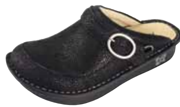
NIGHT GLEAN | SEV-221