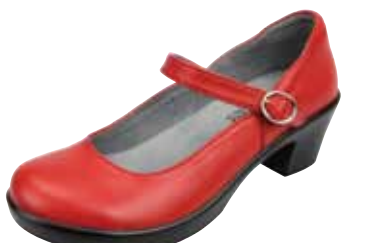
RED BUTTER | HAR-644