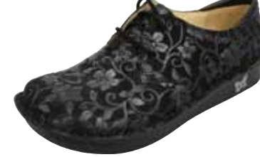
STROLL | BRE-911