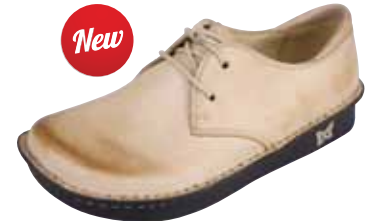
ALMOND BURNISH | BRE-628