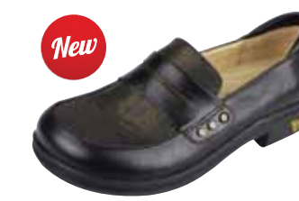
IGUANA SHEEN | TAY-734