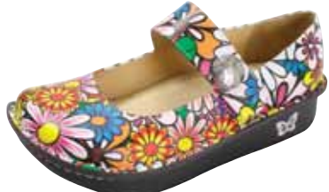
FLOWER POWER | PAL-529