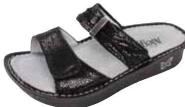
BLACK METALLIC FUN | KAR-237