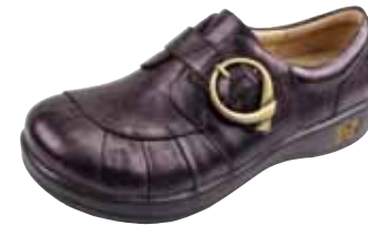
COPPER STREAK | KHL-512

The Khloe is a full-coverage loafer on the slimmer Career Fashion Pro outsole. Uniquely designed with intricate hand sewn pleating on the leather upper and an oversized metallic buckle. Padded heel collar and adjustable tab closure allow for easy slip on and off.