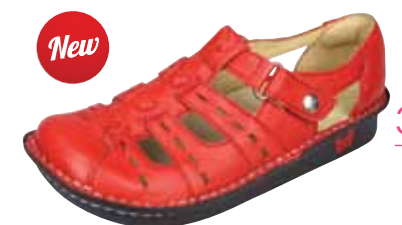
TOMATO | PES-623