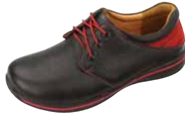
BLACK TUMBLED w/RED | AM-ALE-611