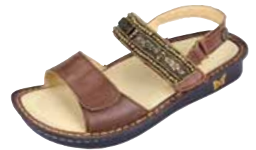
ANTIQUE BRASS | VER-832