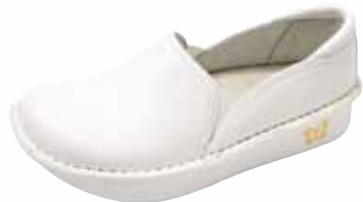
WHITE NAPPA | DEB-600