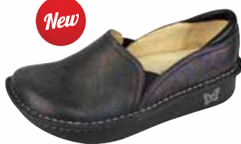
LIZARD SHEEN | DEB-733