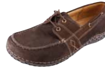
CHOCO | AM-FRA-208

The Franklin is Alegria's take on a boat shoe styling. This shoe features two eyelet lace-up with a velvety suede upper on the ultra slim and flexible hexagon outsole.