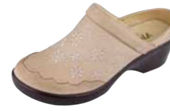
CREAM | ISA-610