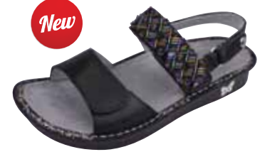
FIESTA DE NOCHE | VER-649