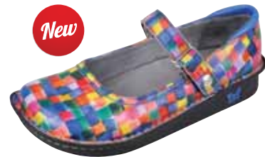
BLOT-DEE-DA | BEL-569