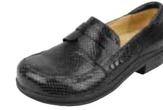
BLACK GLOSSY SNAKE | TAY-721