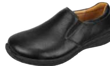
BLACK TUMBLED | AM-AAR-101

The Aaron is a youthful and versatile casual slip-on available in colorful suede or rich nappa leather. Double elastic gores on the vamp allow for easy slip on and off.