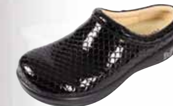
BLACK DROPLET | KAY-430