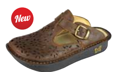
BREEZY TAWNY | ALG-644