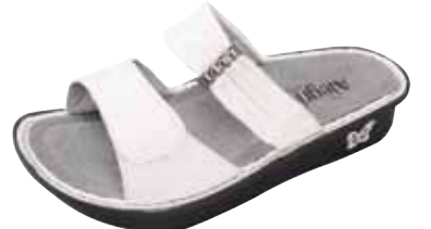
WHITE NAPPA | KAR-600