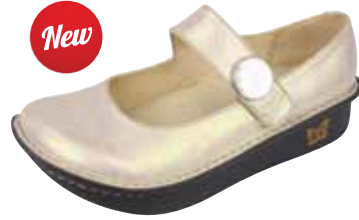
ABALONE | PAL-243