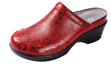
YEEHAW RED | ISA-694