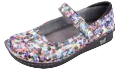
MULTI CUBE | BEL-568