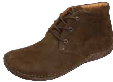
CHOCO NUBUCK | AM-JAK-240