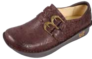
CHOCO EMBOSSED PAISLEY | ALL-433