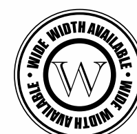
Wide Width Available