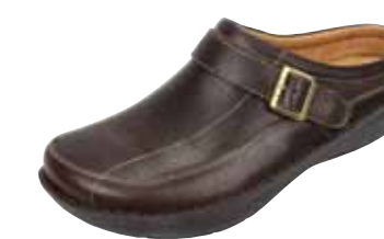
DARK BROWN WAX TUMBLED | AM-CHA-120