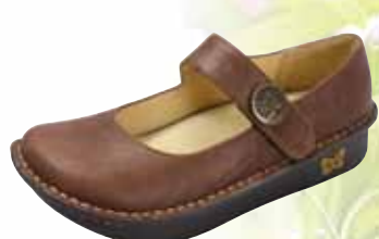
BROWN MAGIC | PAL-682