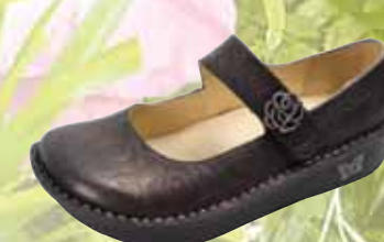
ROSE SHADOW | PAL-683