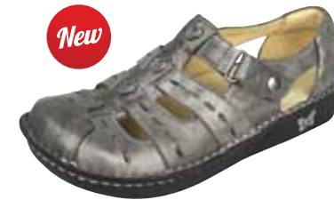
PEWTER EASY | PES-204