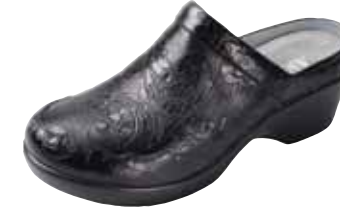
YEEHAW BLACK | ISA-691