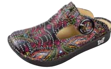
ELECTRO NATIVE | DON-301