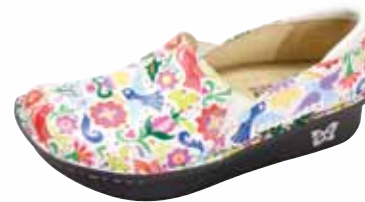
SWEETISH WHITE | DEB-573