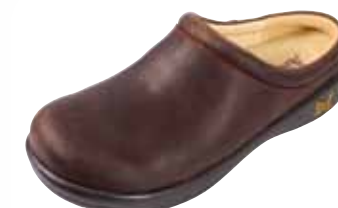
GRAVY | KAY-602