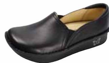
BLACK NAPPA | DEB-601