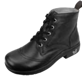
BLACK BUTTER | KYL-641

The Kylie is a rugged, menswear-inspired lace-up ankle boot. Constructed with supple leather upper and paired with a removable footbed made with soft polyurethane, cork and memory foam for a custom fit and superior support.