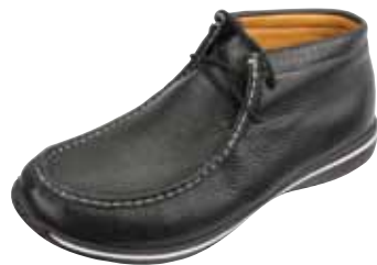
BLACK TUMBLED | AM-PAC-100

A high top casual boot on a sporty rubber outsole. Selections include soft tumble leather or velvety colorful suede.