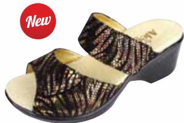
GOLDEN JUNGLE | ASH-542

The Asha is Alegria's latest spin on the exposed footbed styling. This beautiful slip-resistant wedge features dual adjustable straps and shimmery leather upper.