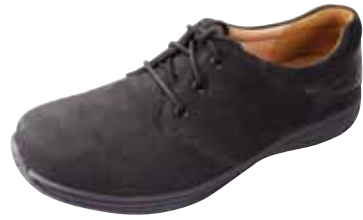
BLACK NUBUCK | AM-ALE-200

The Alex is a casual lace-up oxford on a sporty rubber outsole, accentuated with contrasting color blocks and outline stitches. Available in soft suede or rich nappa leather.