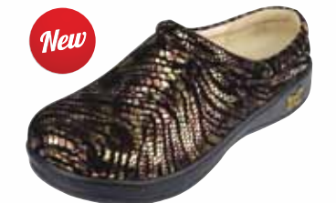
GOLDEN JUNGLE | KAY-542