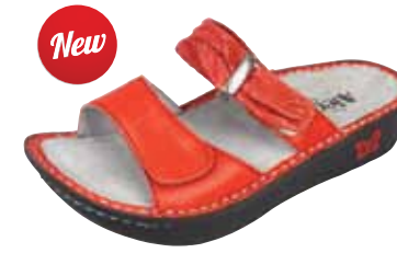
TANGERINE MIXER | KAR-107