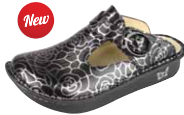
ONYX ROSE | ALG-530