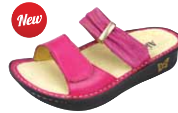
FUCHSIA MIXER | KAR-105