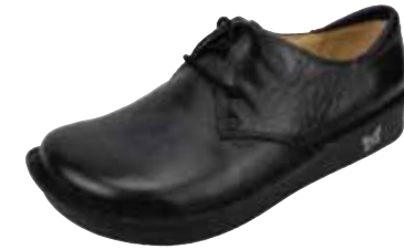
BURNISH BLACK | BRE-611