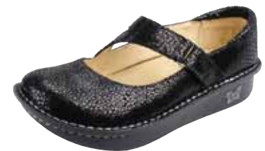
BLACK DOTDIE | DAY-561