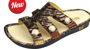
BRONZE GLEM | VEN-714