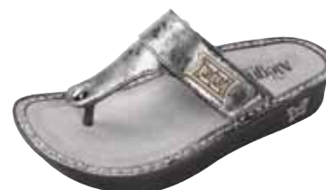
PEWTER BLACK TUMBLE | CAR-621