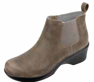
STONEWALL | EVE-603