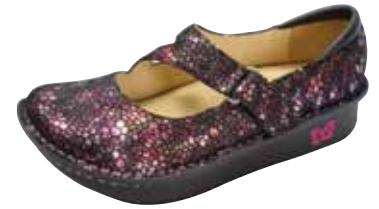
RED METALLIC FUN | DAY-249