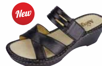
ABALONE | LEI-243