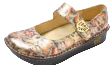
LEAF | PAL-510