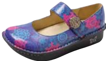
KALEIDOSCOPE | PAL-217