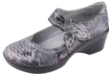
ONYX SNAKE | ELL-730