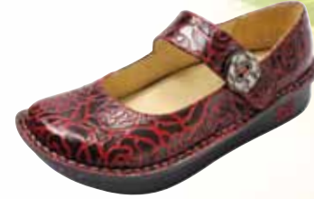
WINE EMBOSSED ROSE | PAL-534