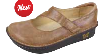
DESERT ESSENCE | DAY-684