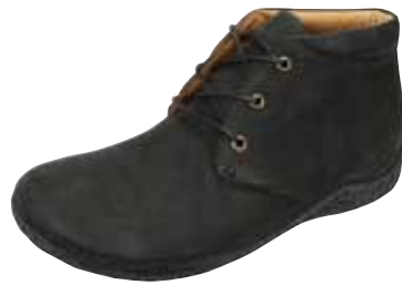
BLACK NUBUCK | AM-JAK-200

The Jake is a classic lace-up ankle boot on the flexible lightweight hexagon outsole. Constructed with soft leather upper and lining, and with a removable footbed to allow for medium and wide width fitting.