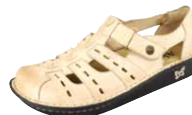
ALMOND | PES-628