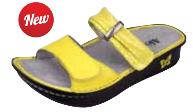
LEMON MIXER | KAR-108