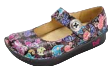
WOMAN'S BEST FRIEND | PAL-397