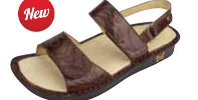
YEEHAW BROWN | VER-574