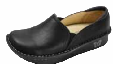
BLACK MAGIC | DEB-688