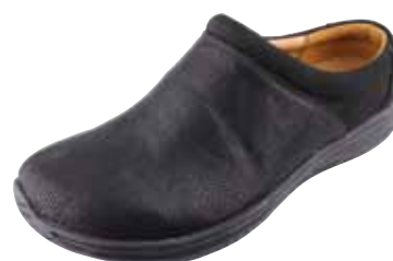
BLACK | AM-ART-100

This fashionable slip-on features eye-catching two-tone leather detailing on a sporty rubber outsole. Outfitted with a removable footbed to allow for medium and wide width fitting.