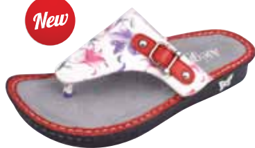
LILY | VAN-322