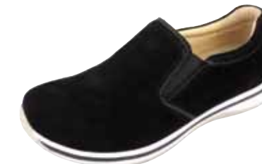
BLACK SUEDE | AM-AAR-601