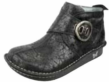
DESERT BLACK | CAT-558

The sparkly Hazel is a spruced-up T-strap heel featuring hand sewn beading and an easy fit tab closure. Outfitted with a removable footbed to accommodate medium and wide widths for a custom fit and superior support.