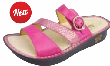
FUCHSIA | COL-115