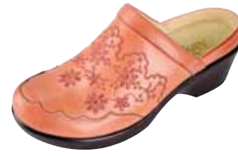
SALMON BURNISH | ISA-609