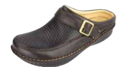
CHOCO WOVEN | AM-CHA-203