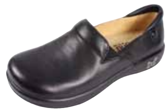
BLACK NAPPA | KEL-601