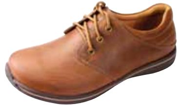
TAWNY | AM-ALE-250