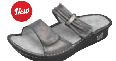
PEWTER EASY | KAR-204