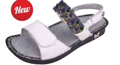
FIESTA DE DIA | VER-650