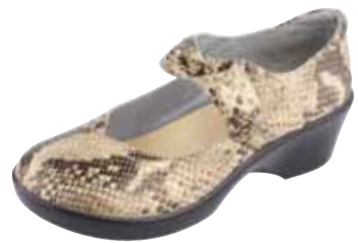
GOLD SPAN SNAKE | ELL-729