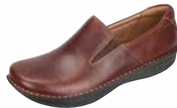
CHOCO WAX TUMBLED | AM-OZ-145