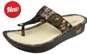
ROMAN | CAR-385