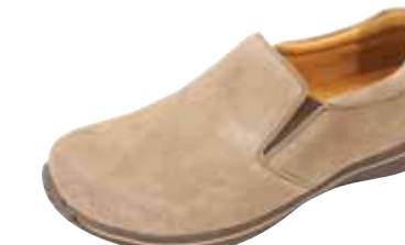
STONE SUEDE | AM-AAR-719