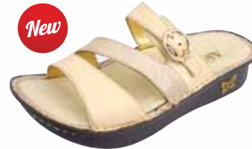
OAT | COL-638