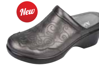
PEWTER EASY | ISA-204