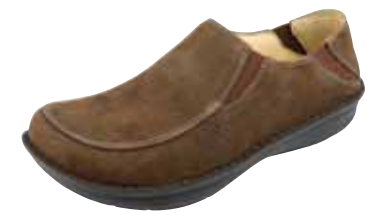
CHOCO NUBUCK | AM-SCH-200