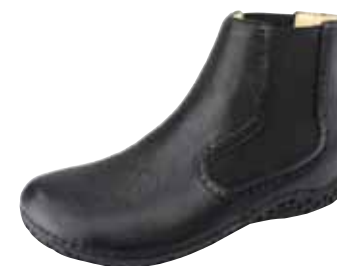
BLACK TUMBLED | AM-JON-100

The Jony is a sleek, sophisticated ankle boot. Equipped with double elastic gores and a back zipper for easy slip on and off. Constructed on the flexible lightweight hexagon outsole.