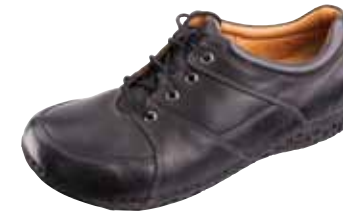
BLACK WAXY | AM-BAR-100

A casual lace-up shoe on the lightweight hexagon outsole, the Bartlett is offered in two different waxy leather finishes. Outfitted with a removable footbed for medium and wide width fitting.