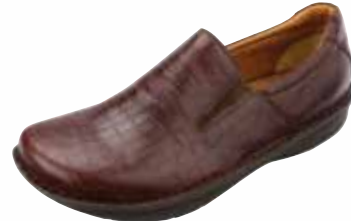
CHOCO ALLIGATOR | AM-OZ-202