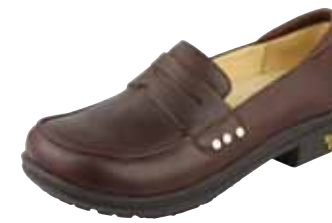
GRAVY PULL-UP | TAY-602

The Taylor is Alegria's spin on the classic penny loafer. Features timeless cap toe stitching paired with three subtle stud ornamentation. Rubber slip resistant outsole makes this shoe suitable for various working environments.