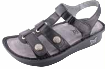
DUSTY BLACK | KLE-631