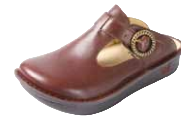
SUNNED | ALG-662