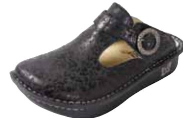
DESERT BLACK | ALG-558