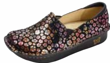
BUTTERCUP | DEB-482