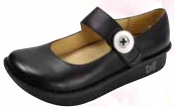
BLACK NAPPA | PAL-601