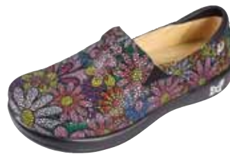
DAISY CHAIN | KEL-564