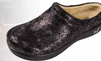
BUBBLE TROUBLE | KAY-241