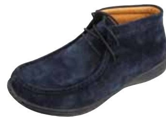
NAVY SUEDE | AM-PAC-603