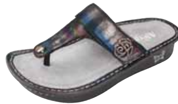
BLUE RAINBOW | CAR-224