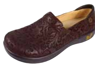
CHOCO EMBOSSED PAISLEY | KEL-433