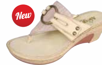
BLACK REPTILE | LOL-731