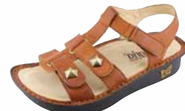
COGNAC BURNISH | KLE-647