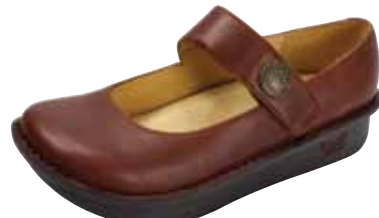
SUNNED | PAL-662