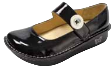
BLACK PATENT | PAL-101

A timeless style with an Alegria twist, the Paloma is the perfect shoe for any occasion. This easy-fit Mary Jane features an incredible selection of colorful leather uppers, each with its own unique ornamentation. Offered on the mild rocker outsole with a removable footbed for all day comfort and support.