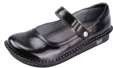
BLACK CRINKLE | BEL-101

The Belle is a Mary Jane on the lightweight mini rocker outsole. This shoe offers all of the comfort found in Alegria's mild rocker outsole but on a slimmer, lower profile. Dual adjustable straps allow for easy slip on and off. Finished with an understated button ornament.