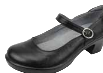
BLACK BUTTER | HAR-641