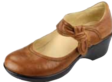
SADDLE | ELL-632