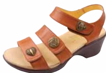
COGNAC BURNISH | OLI-647