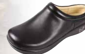
BLACK NAPPA | KAY-601