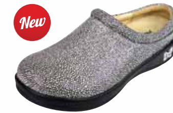
OPAL TROUBLE | KAY-248