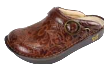
YEEHAW BROWN | SEV-574