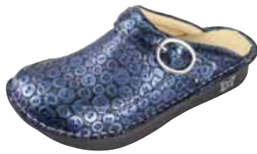
BUTTON-UP | SEV-213

The Seville features hand sewn leather upper on the mild rocker outsole and offers two styling options. The convertible swivel strap allows the shoe to be worn as an open back clog or as a sling back shoe. Tailored stitching along the toe cap provides added interest.