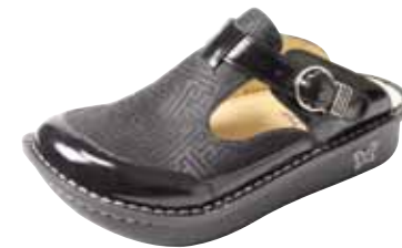
MAZIE | ALG-811