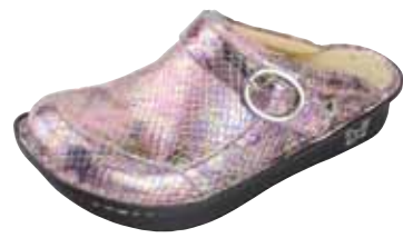
SHIMMER ME TIMBERS | SEV-218