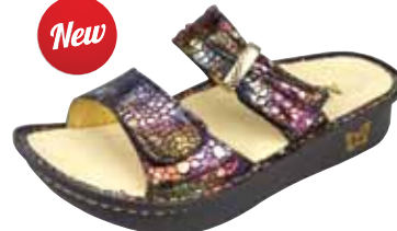
RAINBOW FUN | KAR-247