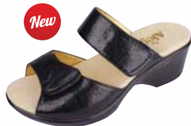
BLACK CRACKLE | ASH-661