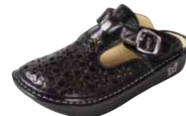
BREEZY DUSTY BLACK | ALG-631