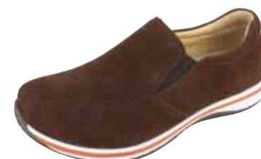
CAFE SUEDE | AM-AAR-602