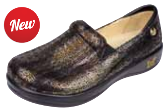
FANCY GIRAFFE | KEL-412