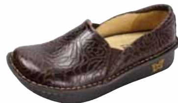
BROWN EMBOSSED ROSE | DEB-532