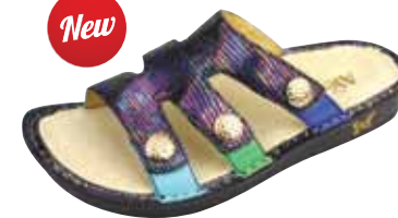
BLUE GLEM | VEN-718