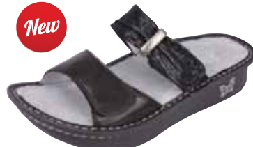
BLACK MIXER | KAR-111