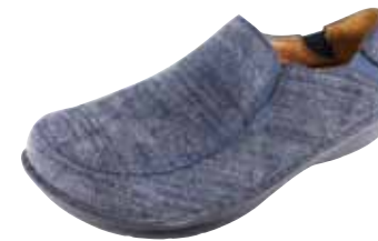
NAVY | AM-SCH-312