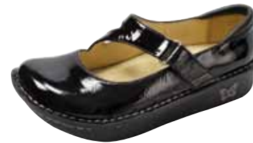
BLACK PATENT | DAY-101

The Dayna is a twist on the classic Mary Jane styling, with a triangular opening detail on the strap. Loop-and-hook closure for easy slip on and off. The Professional Collection features stain-resistant leather for easy maintenance and lab-tested slip-resistant outsole for assuring confidence on any surface.