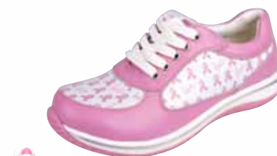
PINK RIBBON POWER | CIN-634

Alegria takes on the athletic shoe with the Cindi. The playful pattern on the leather upper makes this shoe uniquely Alegria. Outfitted with a removable footbed for a custom fit and superior support.