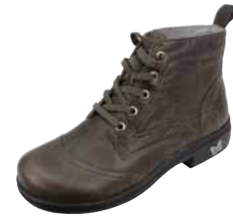
DRIFTED | KYL-643