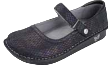
METAL RAIN | BEL-751