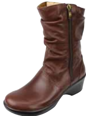
ESPRESSO BUTTER | IVY-642