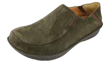
OLIVE SUEDE | AM-SCH-700