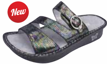
ROYALS | COL-103

The Colette is the latest slide sandal to be offered on the mild rocker bottom. This elegant sandal is a dressier take on a traditional slide, with a distinctive diagonal strap accent and jewel ornamentation.