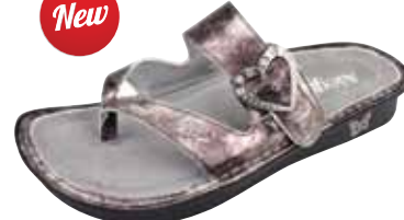
IRON LADY | VAL-563