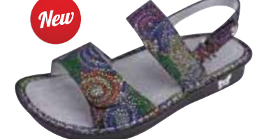
BULLSEYE | VER-387