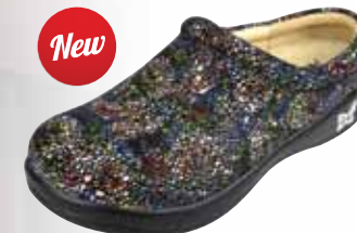
CATHEDRAL | KAY-391