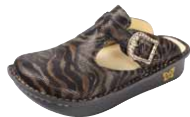
SAFARI | ALG-434