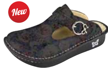
MULTI DOT FLORAL | ALG-509