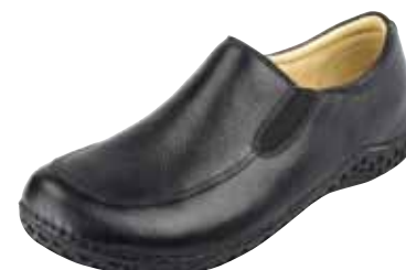
BLACK TUMBLED | AM-FOX-100

The Foxe is a classic slip-on with rich leather uppers. The flexible lightweight hexagon outsole delivers a sleek silhouette. Outfitted with a removable footbed to allow for medium and wide width fitting.