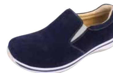
NAVY SUEDE | AM-AAR-603