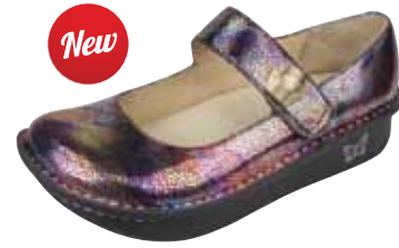
TOTS GORGE | PAL-330