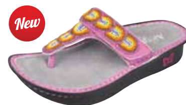
BEAD-AZZLED | CAR-655