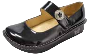
BLACK GLITTER PATENT | PAL-249