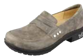
STONEWALL | TAY-603